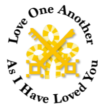
St Peter's Catholic Academy

They will also be asking for donations for the Dougie Mac on Christmas jumper day which will be on 20th December.